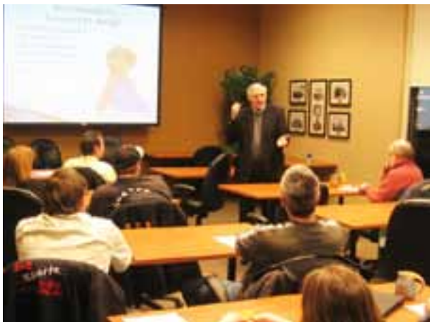
Southwest Minnesota entrepreneurs attend educational seminars that address economic and trending needs, like this “Surviving the Recession” seminar series. Entrepreneurs gained new business ideas for dealing with a new economic reality. Many of these participants have continued to attend other seminars and classes.